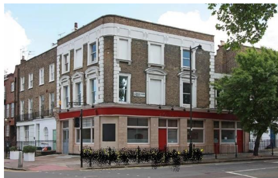
Church on the Corner, 64 Barnsbury Road, N1 0ES

The 'Caledonian Road and Barnsbury' Overground station is also two minutes walk from St Andrew's.