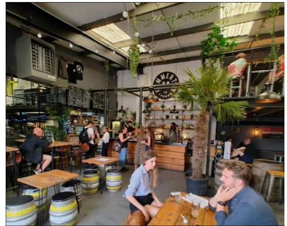
Hammerton Brewery taproom

16:00 to 17:30 Informal public concert in St A's