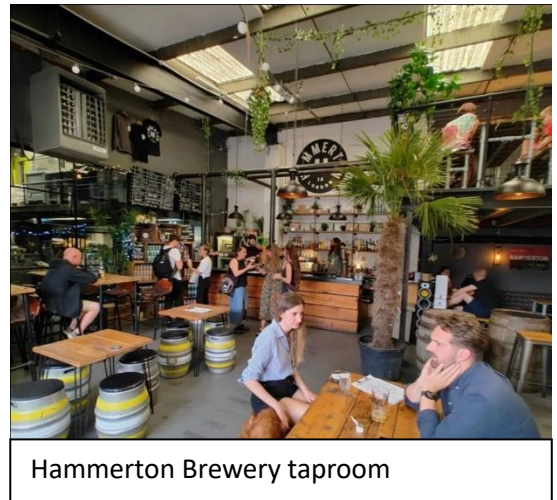
Hammerton Brewery taproom

17:30-18:45 Morris & Taborers at Hammerton Brewery