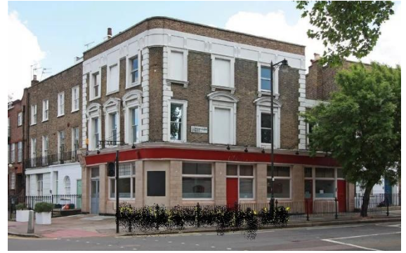
Church on the Corner, 64 Barnsbury Road, N1 0ES

The 'Caledonian Road and Barnsbury' Overground station is also two minutes walk from St Andrew's.